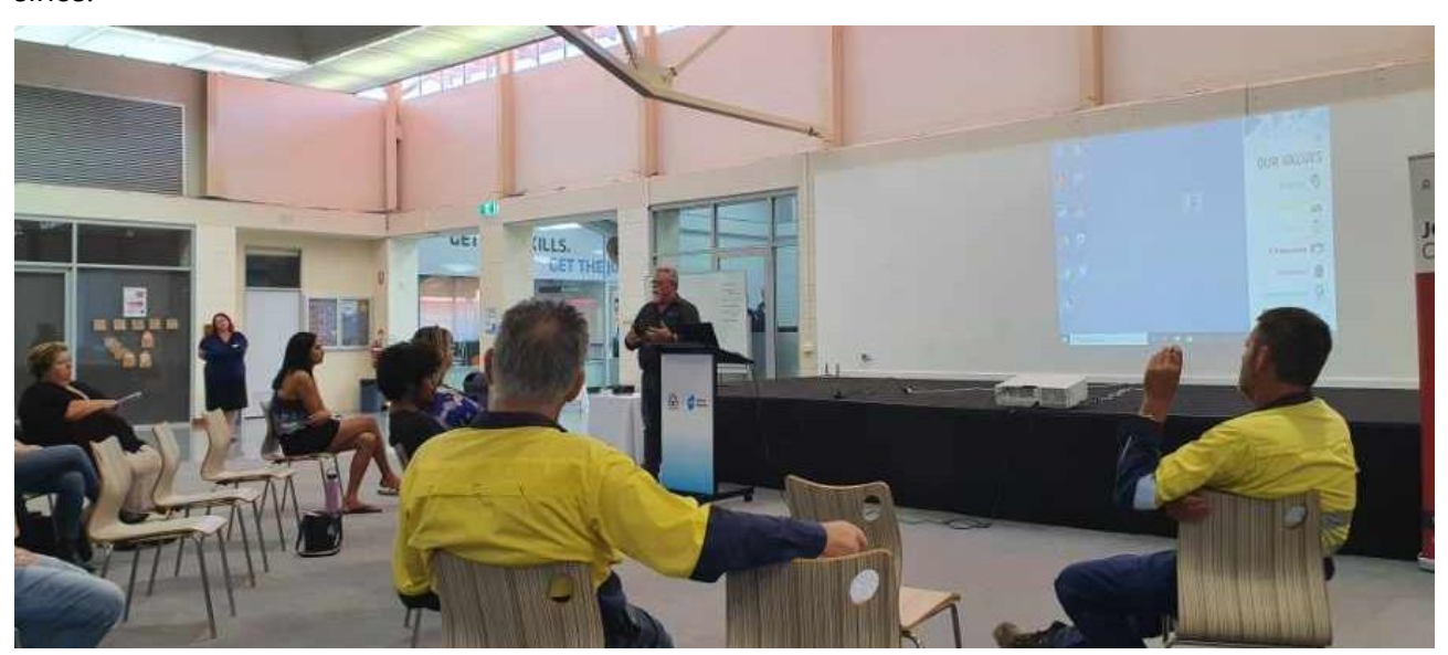
Figure 5 – TAFE presentation 17 January 2021

The Project Manager encouraged those holding a valid C-class licence to obtain a basic traffic controller ticket and, following successful completion of the course, register interest with Advanced Traffic Management (ATM) who are engaged as a major supplier for the duration of the Project. The implementation of this strategy not only supports Indigenous engagement on the Project, but also ensured ATMs workforce capacity and addressed any skill gaps. As a result of the presentation, a Kalgoorlie local joined the project as a traffic controller in March, and remaining with the Project since.