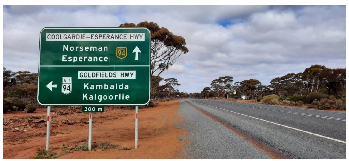
Figure 2 – Signage along Coolgardie-Esperance Highway approaching the Goldfields Highway intersection

The upgrades undertaken by the Project will support the productivity of regional industries on this major freight route, and significantly improve safety for locals, tourists and freight operators alike. During construction, the Project is expected to create over 250 jobs and training opportunities for the local community, with a commitment to prioritise procurement of local products and services.