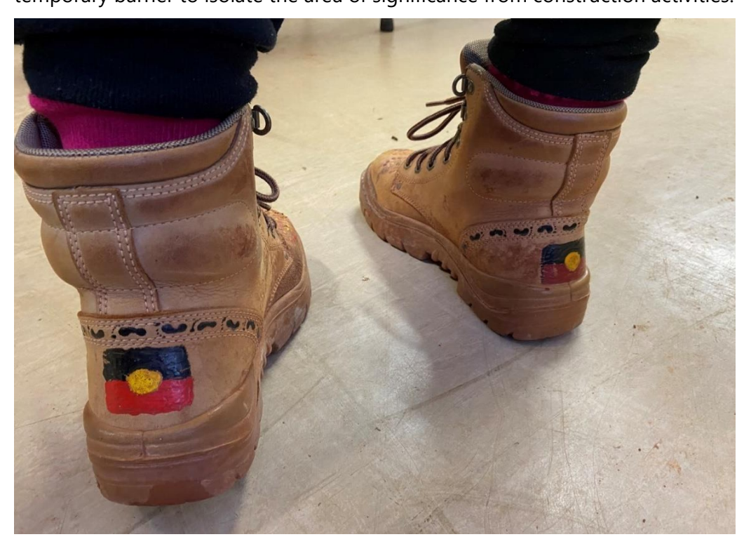
Figure 4 – Emu Rocks Operator

Measures to manage impacts to Aboriginal and European Heritage, including the discovery of an unknown site during works, is detailed in the Project's Environmental Management Plan. While the Project works do not intersect with the known registered site, Highway Construction erected a temporary barrier to isolate the area of significance from construction activities.